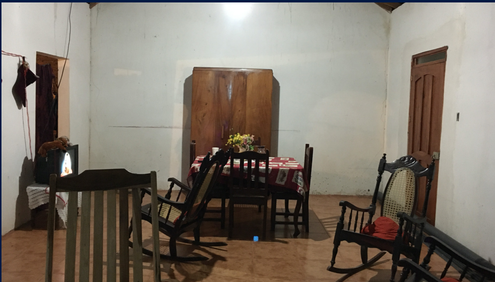
Repaired roof, dining table instead of hammock, tile floors instead of dirt.