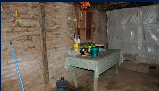
Interior of the home in 2010.