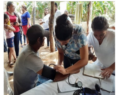
Ashley measuring vital signs and child development markers during medical brigades