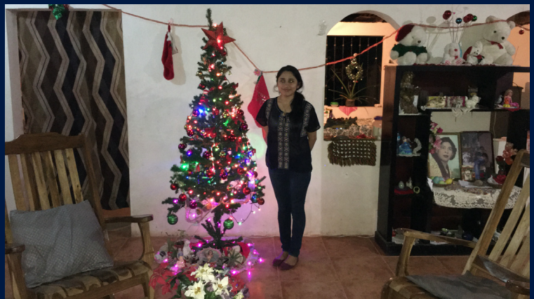
New furniture and walls and real doors instead of plastic.